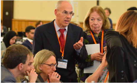
Codex Nutrition meeting in Germany, Nov 2019. US pushing for a lowering of safeguards alongside some of the world's large exporters of UPFs. IBFAN is always present at these meetings.

"The top strategic priority of many transnational marketing and media businesses (who have contributed to the NCD epidemic) is to change traditional food patterns and cultures in lower and middle-income countries." Prof Philip James, the founder of the Obesity Task Force, 2012