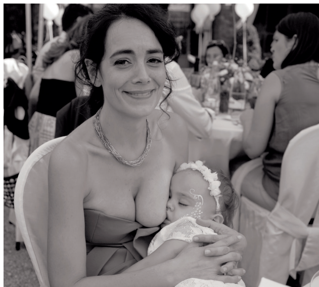
IBFAN Calendar 2017.

This leaflet explains how leaving a legacy or making a gift can help our work continue.