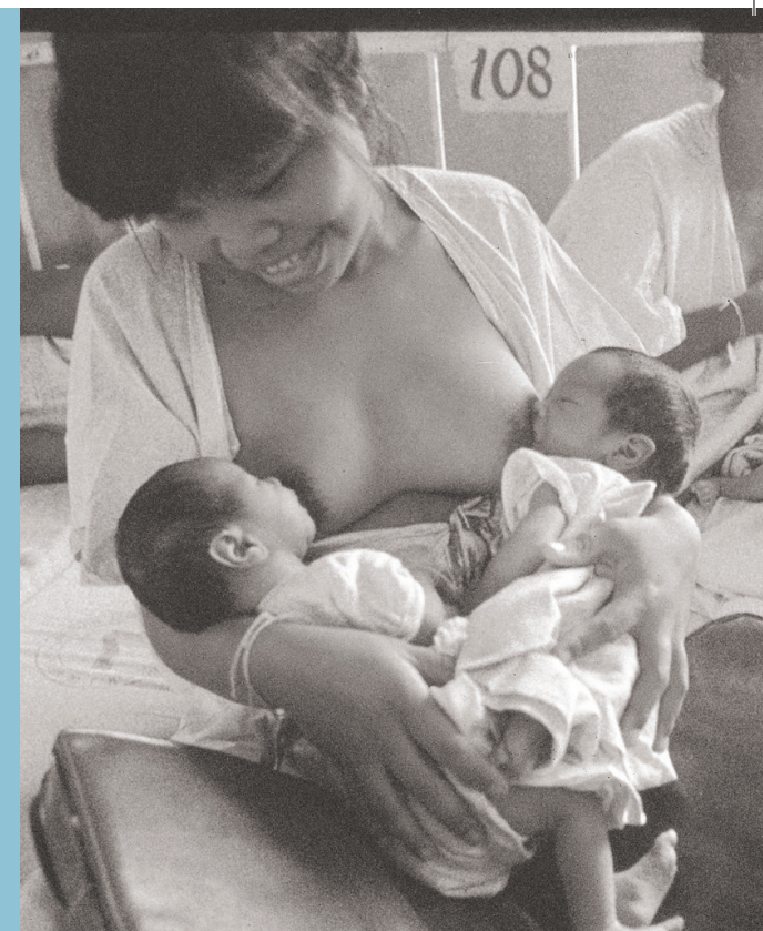
Fabella Hospital, Manila, the Philippines where infection rates were dramatically reduced when routine bottlefeeding was stopped. We helped introduce laws that curb marketing and allow mothers and babies to stay together.

“Breastfeeding is a natural safety net against the worst effects of poverty ... exclusive breastfeeding goes a long way towards cancelling out the health difference between being born into poverty or being born into affluence. It is almost as if breastfeeding takes the infant out of poverty for those few vital months in order to give the child a fairer start in life and compensate for the injustices of the world into which it was born.