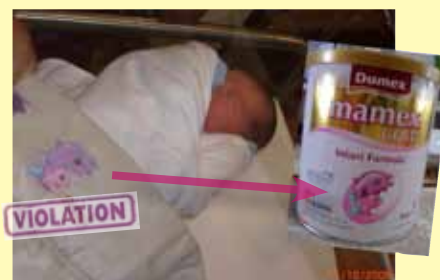
Blanket promotion. Infant formula promotion on baby blankets in a Singapore hospital. The twin dolphin logo on the blanket is the same as on the label of Mamex Gold infant formula (inset)