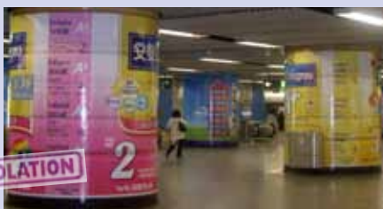
Larger than life. Giant cans of Mead Johnson formulas on pillars in metro stations in Hong Kong.

More conventional marketing methods are still being used; they are now pushier than ever. This happens in countries where the Code has not been implemented as law. Brazen advertising even for infant formula has returned with a vengeance.