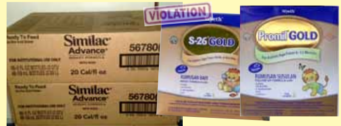
Surprise supplies! In Malaysia, free supplies of Similac (Abbott) S-26 and Promil Gold (Wyeth) were found to be routinely distributed to private hospitals by carton loads.