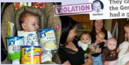
Marketing by any other name – 'brand evaluation' came with gifts like coupons for free formula courtesy of Gerber/Nestlé.