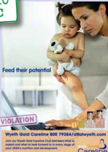
Wyeth Careline – deactivated in Oman for its potential to discourage or undermine breastfeeding.

In the US, visitors can sign up on a website for brands they would like to 'evaluate'. The website then selects hosts to hold parties and sends boxes of goodies for the host, their friends, family and neighbours to try out. These events are powerful branding exercises and are sales driven.