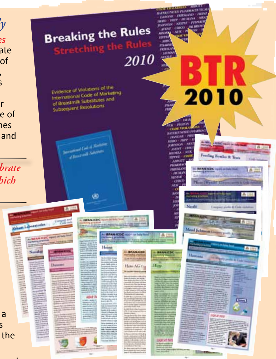
Breaking the Rules, Stretching the Rules 2010 is available on the IBFAN website The Executive Summary, Introduction and Code summary are FREE

Feeding bottles & teats: AVENT • CHICCO • DODIE • DR BROWN • EVENFLO • MEDELA • NUBY • NUK PIGEON • SUAVINEX • TOMMEE TIPPEE