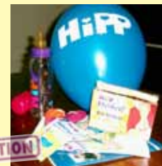
Freebies galore. Hipp gifts for Armenian doctors include doctor's coat, product samples, balloons and bottles.