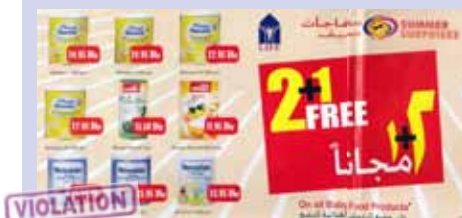
Turning back the clock. A UAE supermarket brochure promotes different infant formulas with tempting discounts.

More conventional marketing methods are still being used; they are now pushier than ever. This happens in countries where the Code has not been implemented as law. Brazen advertising even for infant formula has returned with a vengeance.