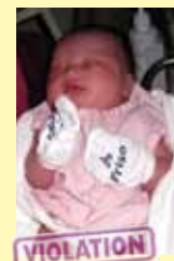
Hand in glove. A hospital in Singapore allows Friso promotion in return for 'hand'some' benefits.