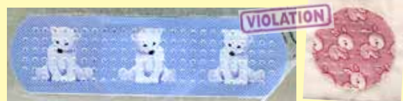
Stick it to them! Even in a wealthy country like France, tiny gifts like plasters carrying Milupa and Guigoz logos are attractive to health workers.