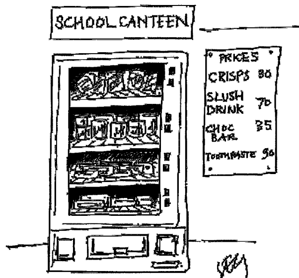
Illustration: Sarah Guthrie (UK)

The food manufacturers are not the only ones at it, either. Tesco is now offering Computers For Schools vouchers at the check-out – the vouchers are emblazoned with the brand logos of its charitable sponsors, which happen to include sugary fizzy drinks Pepsi, Tango and 7-Up, and Dairy Lea, the makers of Dunkers and other such delightful, sodium-and fat-laden snacks that have been targeted at the juvenile lunchbox market. That's not to say that children don't eat such junk foods, anyway, but where is the encouragement for them to eat more healthily?