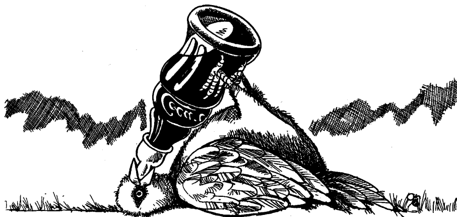
illustration: Habib Haddad (Lebanon)