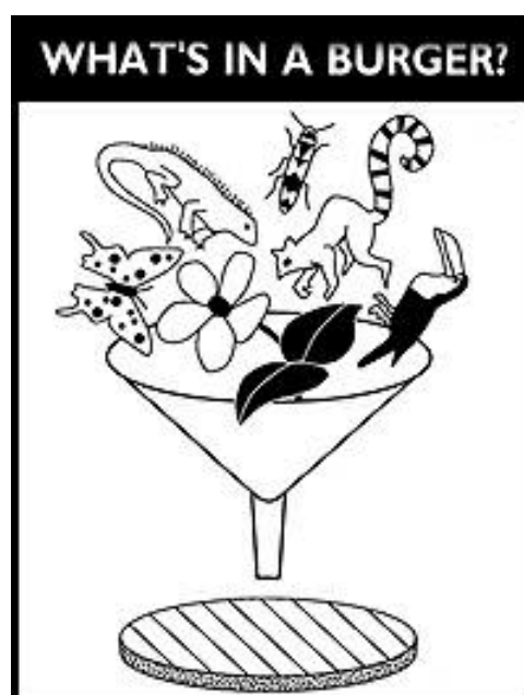
illustration: Corporate Watch (USA)